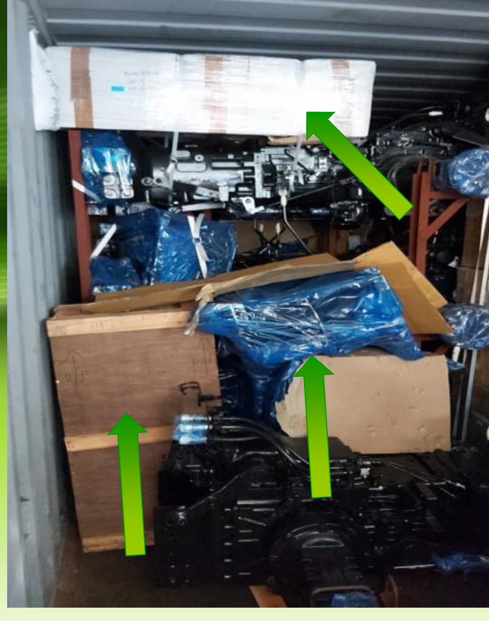
SKID of Transmission