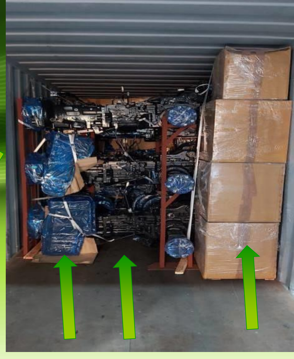
SKID of Transmission, Loose Parts, Safety Plate, Front Tyres