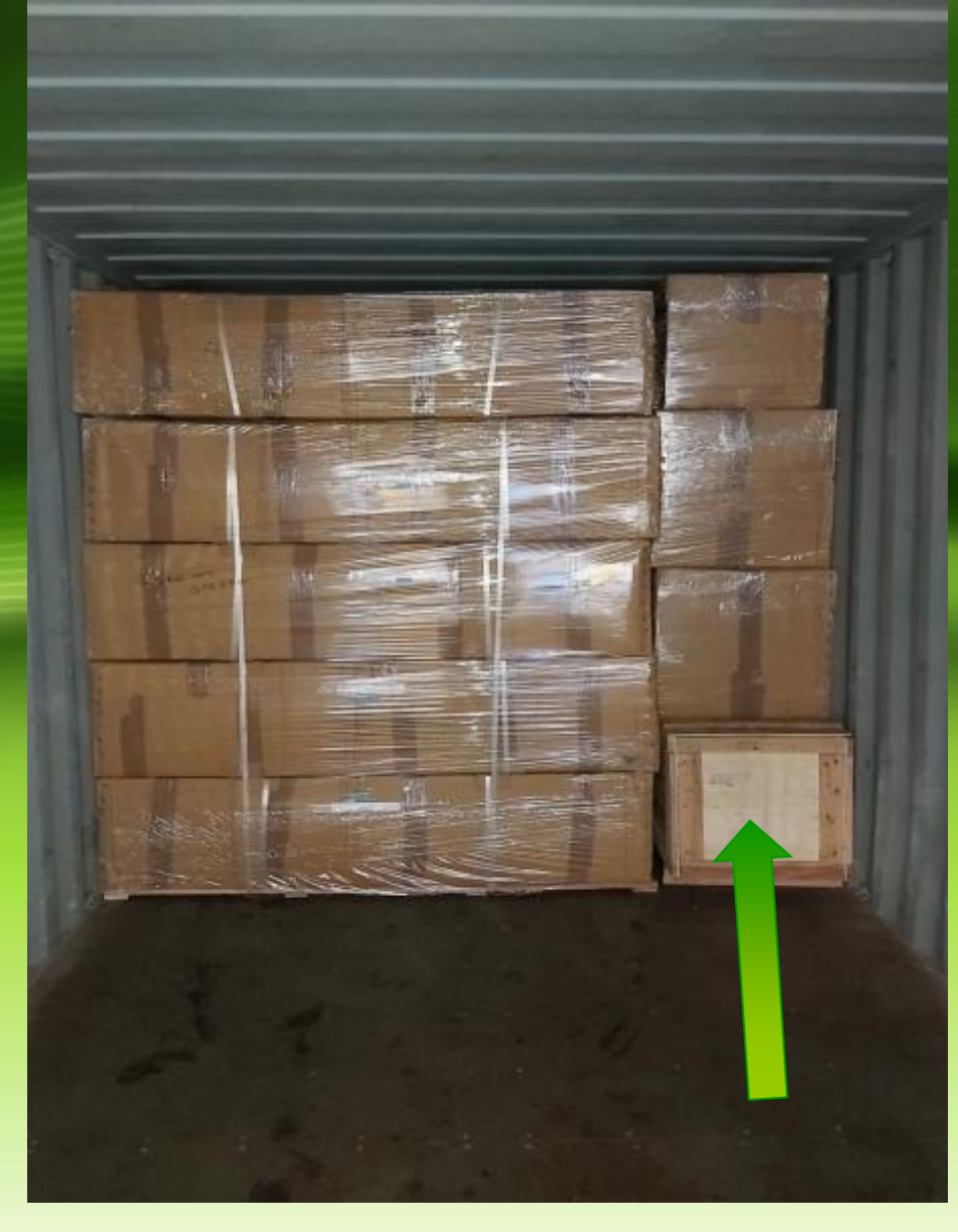
Next Layer of Wooden Box & Carton Box on Right Side