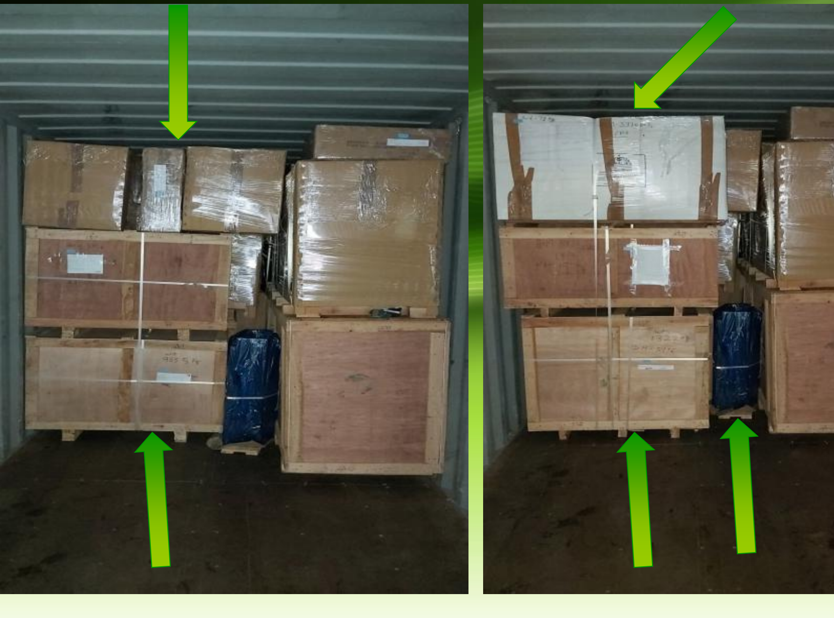
Next Layer of Wooden & Carton Boxes