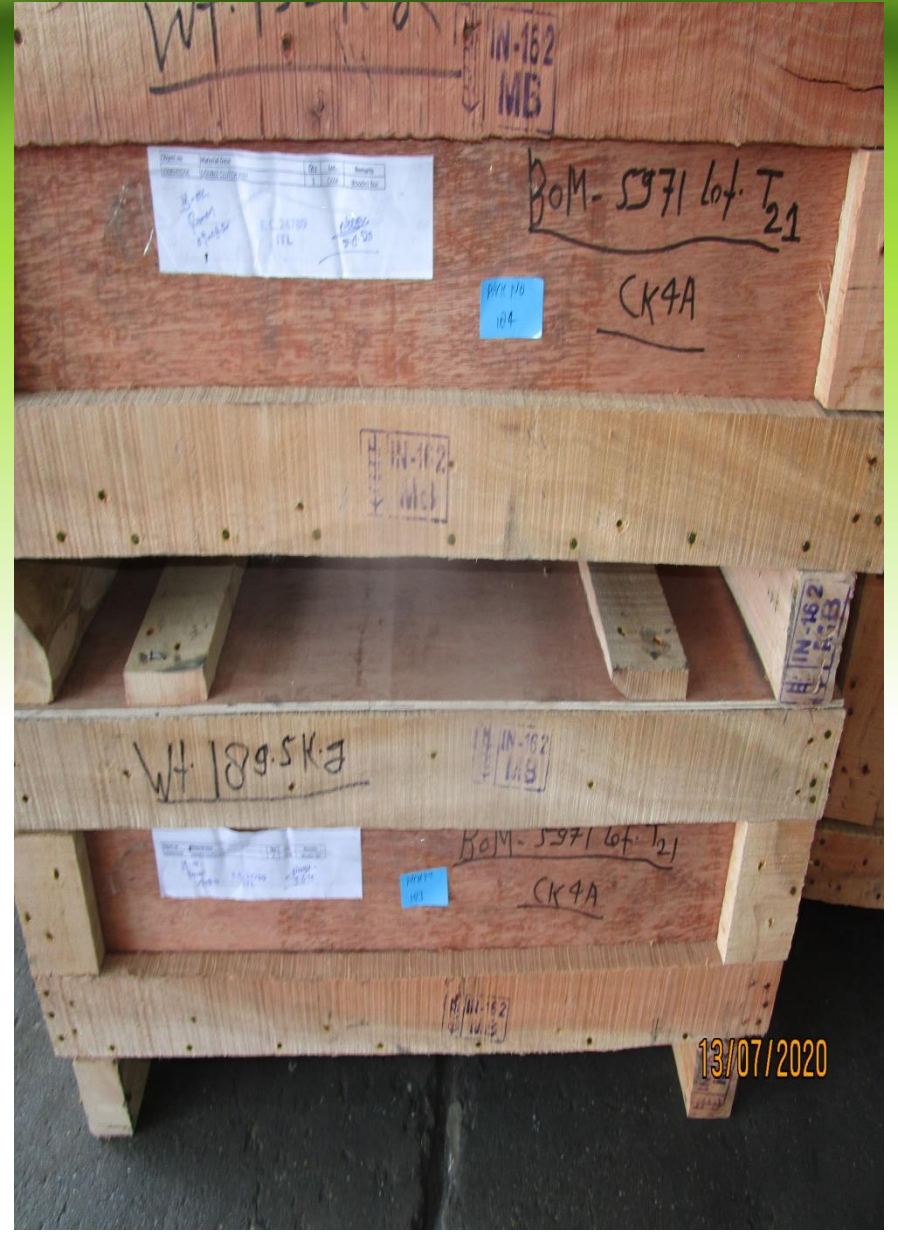
DUAL CLUTCH ASSY.