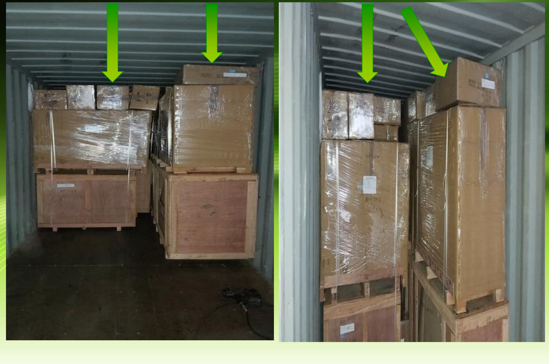
Carton Boxes of tractor's Material On Engine Boxes