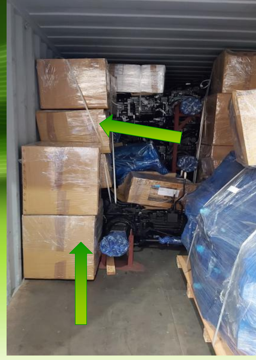
Pallet of Front Axle Assy 4WD by Side Way Condition