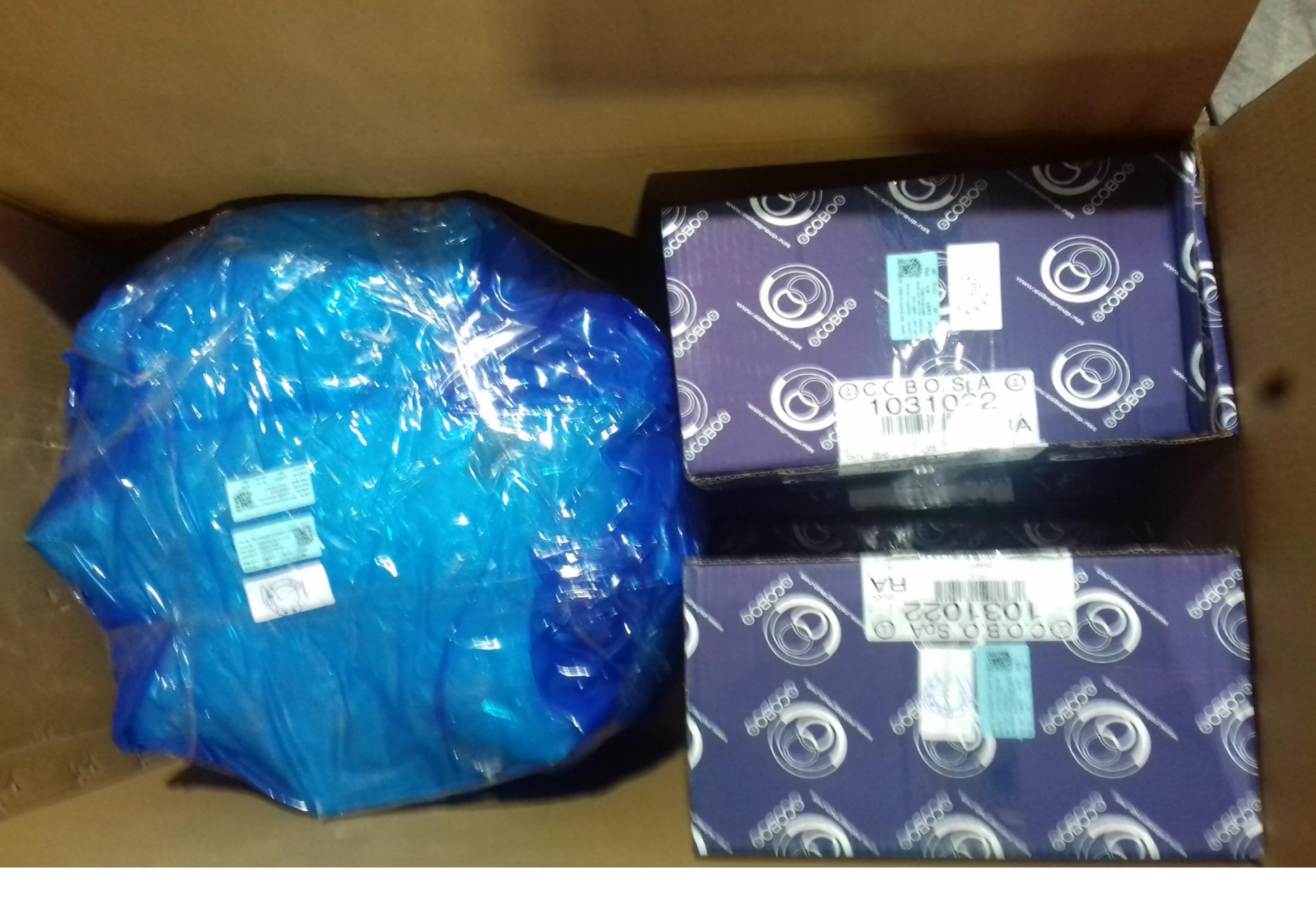
FAN ASSY & LIGHTS