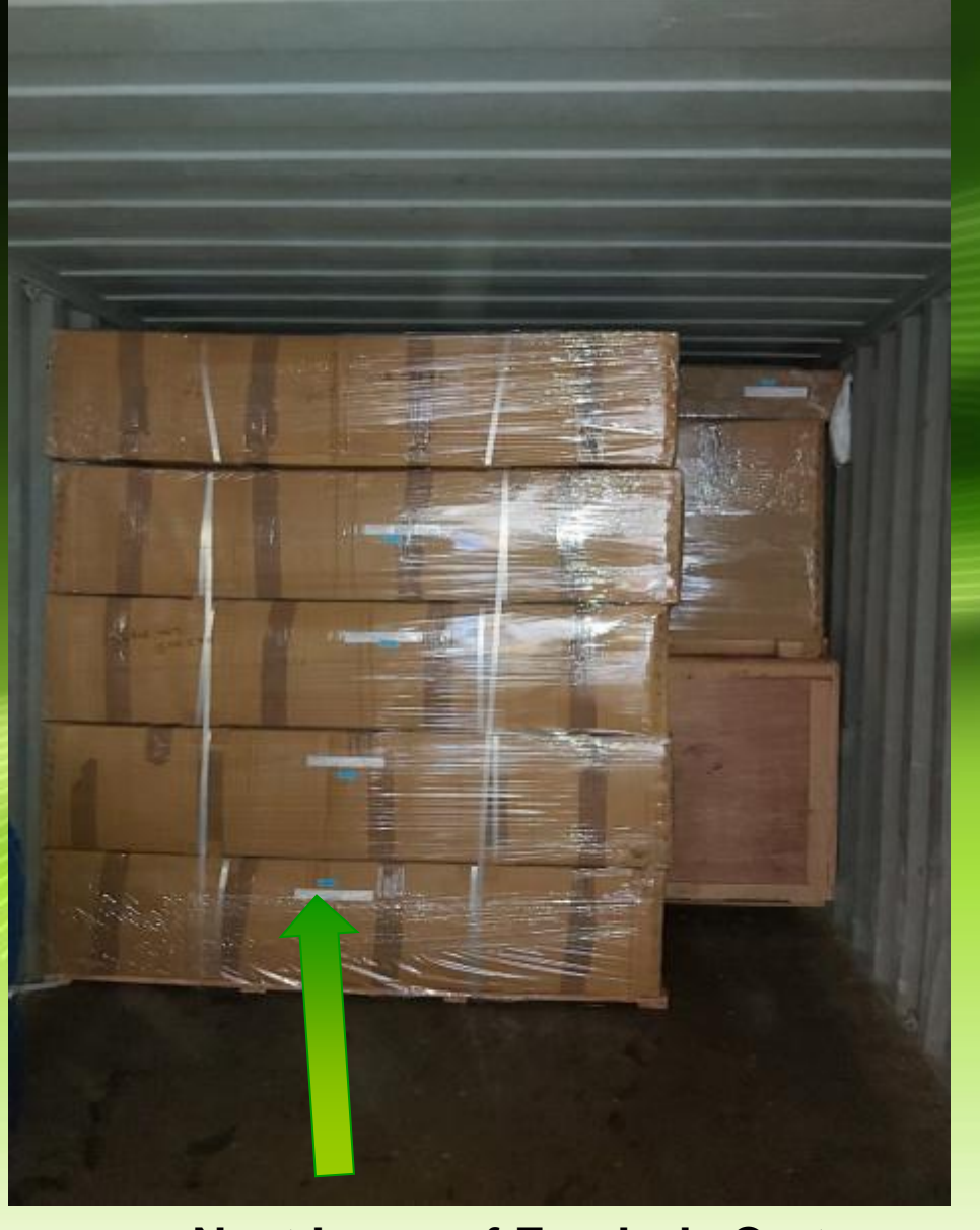
Next Layer of Fender's Carton Boxes Stacked on Left Side