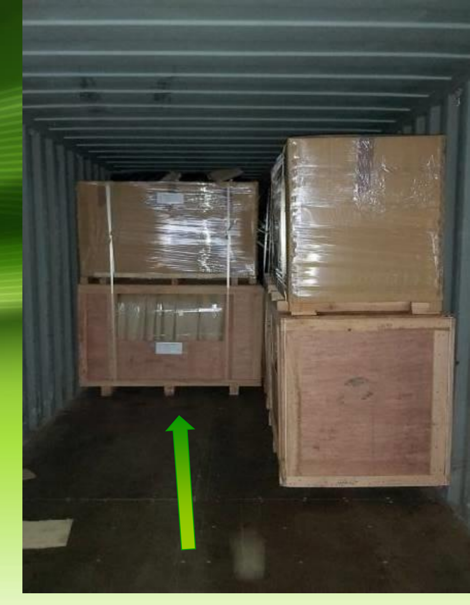
2nd Stack of Two Engine's Boxes in Straight Way Condition