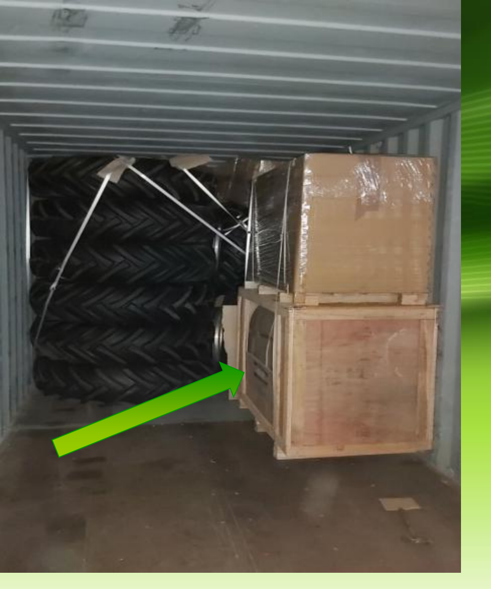
1st Stack of Two Engine's Boxes in Side Way Condition