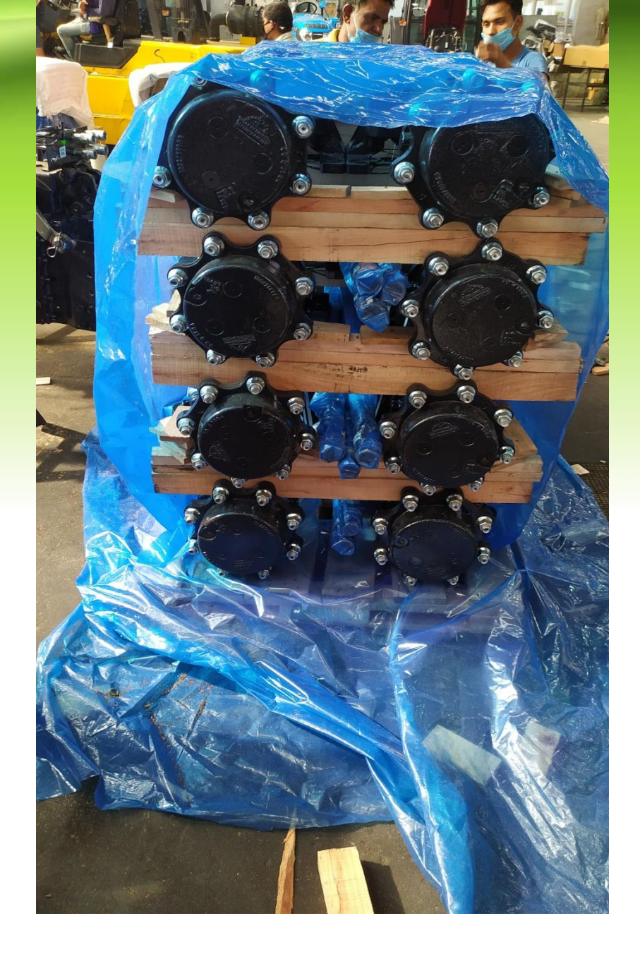
FRONT AXLE ASSY. 4WD