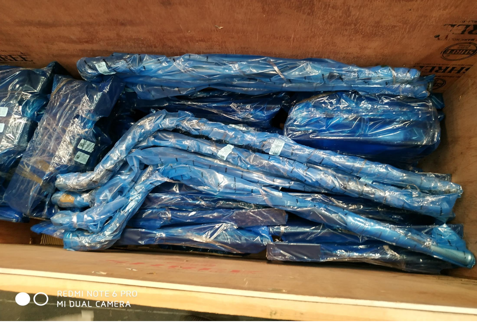
CHASSIS LOOSE PARTS