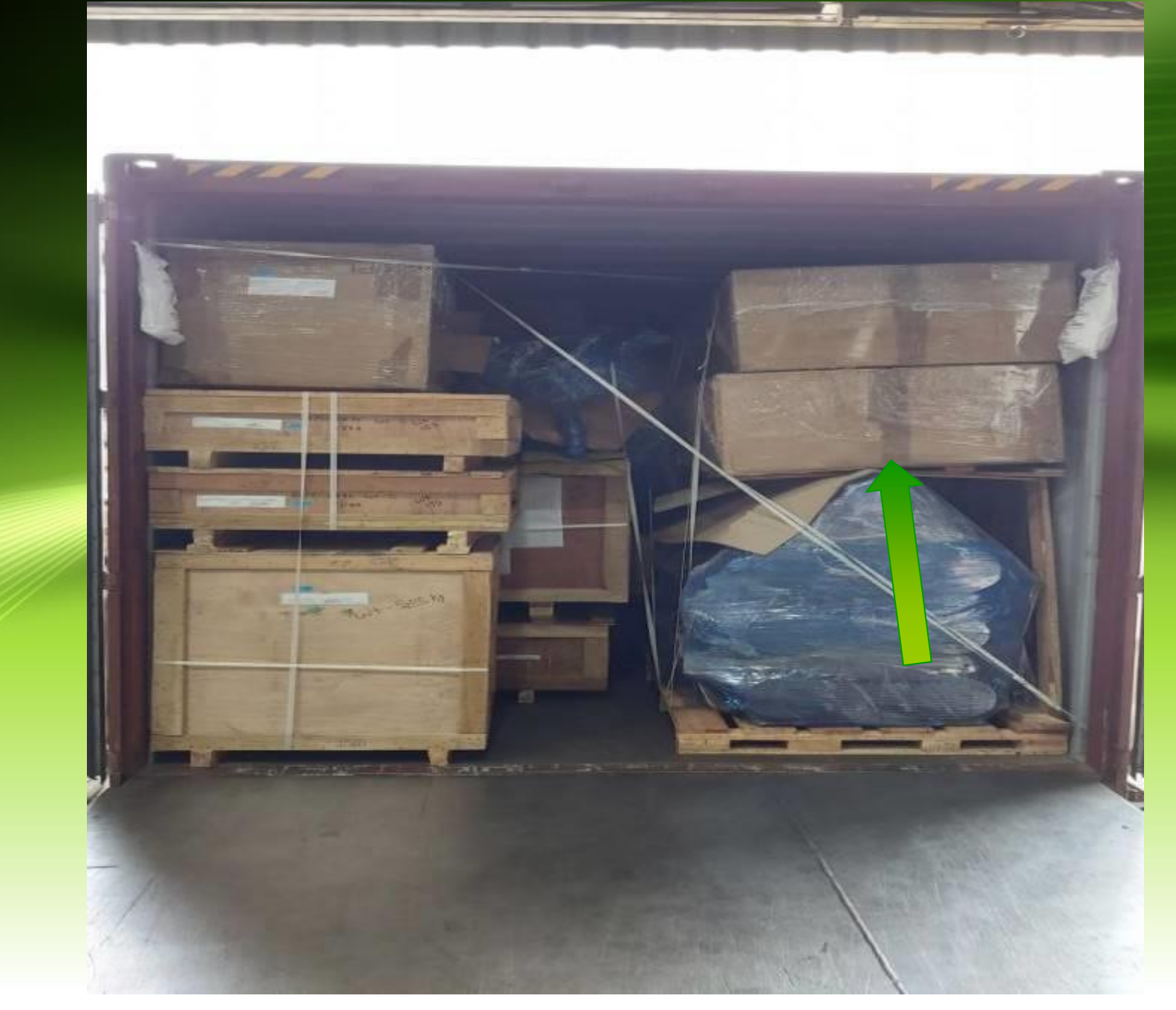
Fender's Carton Boxes on Front Axle Pallet