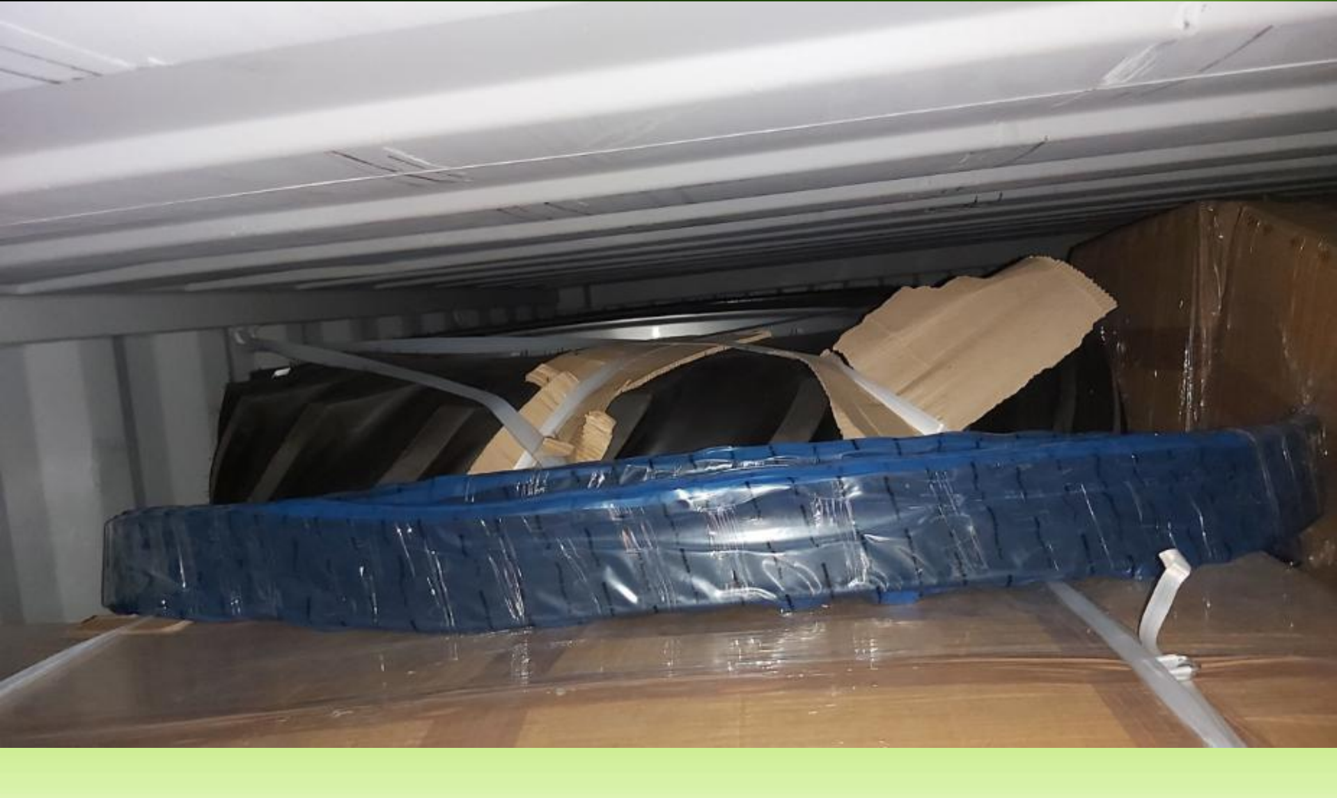
2 Loose Packages of Fender Side Cover On Engine Box which is next to Rear Tyres