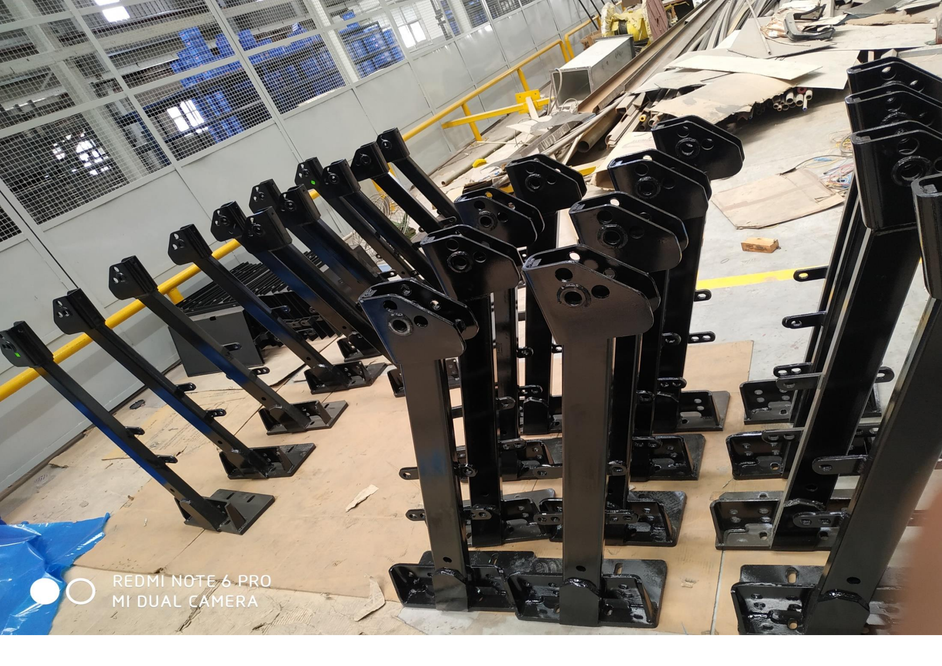
BLACK MATERIAL PLACED FOR QUALITY INSPECTION