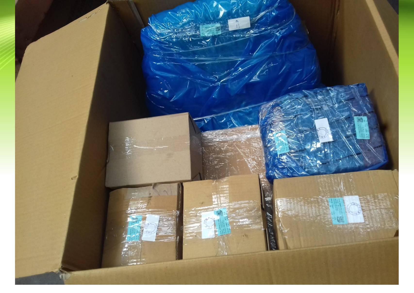
Driver Seat & Lights